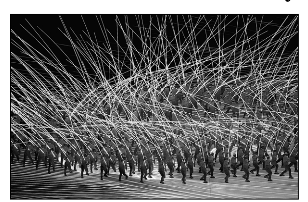
Martial arts students perform during the Games' opening ceremony

To prevent the poles from breaking, the students spent long hours