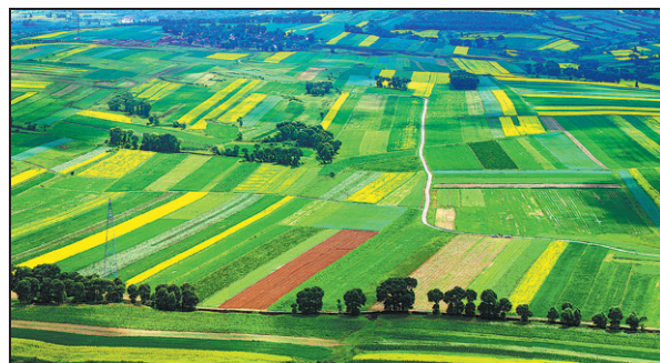
Top: Farmers in Liulin county plant trees close to their farms. Above: Thanks to constant cultivation, forest and grass coverage in Youyu county has increased from 0.3 percent in 1949 to 56 percent in 2019.

county's forest coverage was only 0.3 percent.