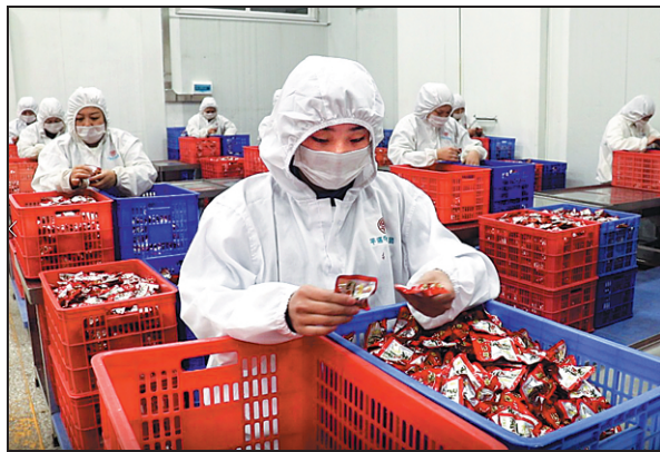
Employees at Pingyao Beef Group inspect products before they are delivered to markets.

The company resumed operations on March 10 as the situation improved in Pingyao.