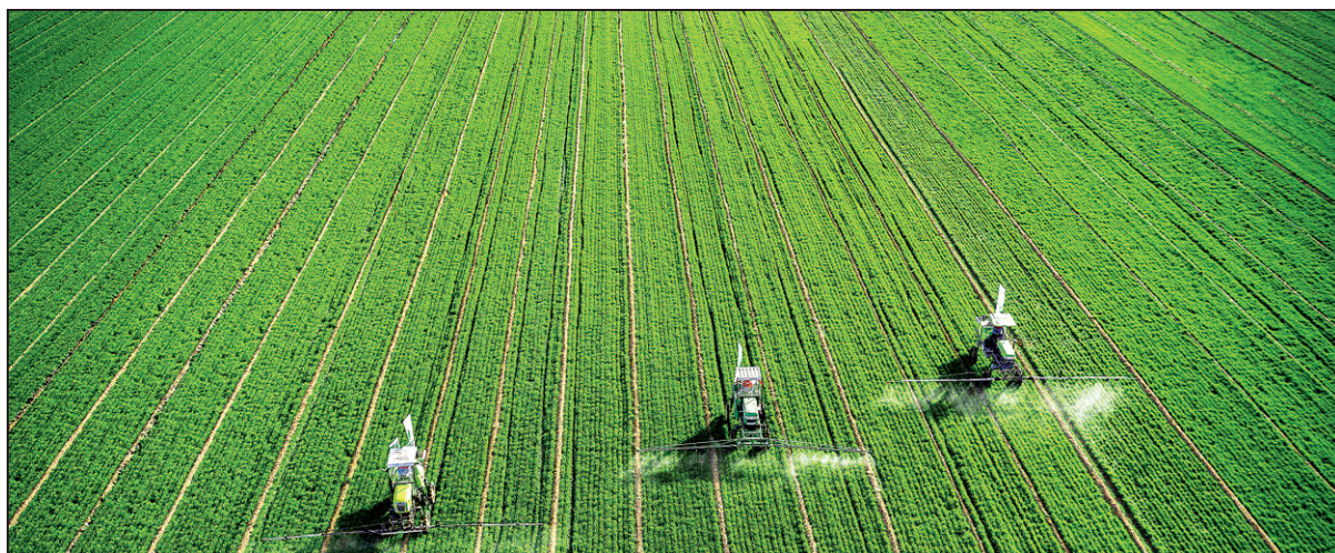
A local agricultural service company uses its tractors to water a wheat field in Xicheng county.