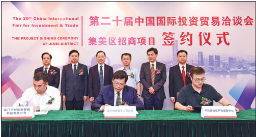
Government officials and entrepreneurs attend a signing ceremony of business projects in Jimei district during this year’s China International Fair for Investment and Trade.

deal with all their affairs at one time, according to an official in charge of the center. Last year, the service center streamlined 1,517 processes, accounting for 90.1 percent of the total. To date, the center has 109 service channels incorporating 60 units. In response to Xiamen’s goal of building 10 investment programs and 12 industrial clusters with an industrial scale of 100 billion yuan ($14.57 billion), Jimei is continuing to enhance its economic transformation and upgrading by introducing top enterprises and programs. The district’s software park, covering an area of 300,000 square meters, is expected