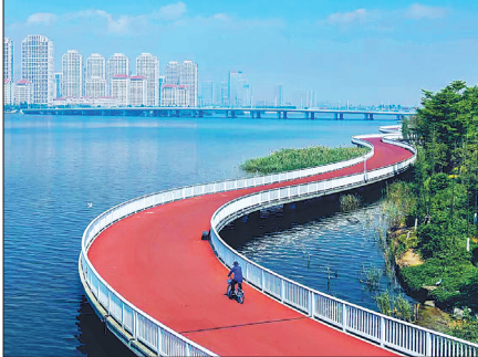
Clockwise from top: Jimei district in Xiamen, Fujian province, has a friendly environment and cultural atmosphere. The Ling Ling International Circus in Jimei attracts visitors from home and abroad. The Jimei School Village features a dedication to learning and self improvement. Visitors enjoy a night run in the district. The cycleway landscape at Jimei’s scenic Xinglin Bay. Giant pandas from Chengdu settle in to their new home in Jimei.