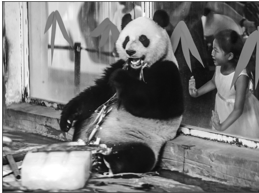
A giant panda chews iced bamboo shoots at the Jinan Zoo in Jinan, Shandong province, on Tuesday. The zoo has adopted various strategies to help the animals stay cool, as scorching and stuffy heat continues in the city.