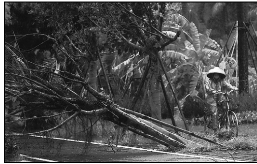
A bicyclist passes a fallen tree in Qionghai, Hainan province, on Wednesday. Typhoon Son-Tinh made landfall on the island province at around 4:50 am that day.

Son-Tinh is moving westward at 30 km/h and was expected to reach the southern sea areas of the Beibu Gulf on Wednesday afternoon and