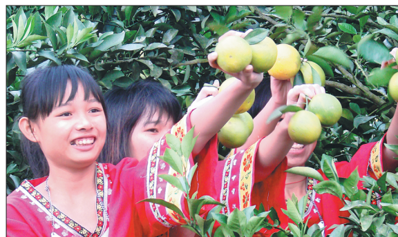
Tourists pick green oranges fresh from the tree at an orange garden owned by Hainan's Haikou Group.

High-technology has also been applied to enhance high-efficiency farming on the island. The Nether-