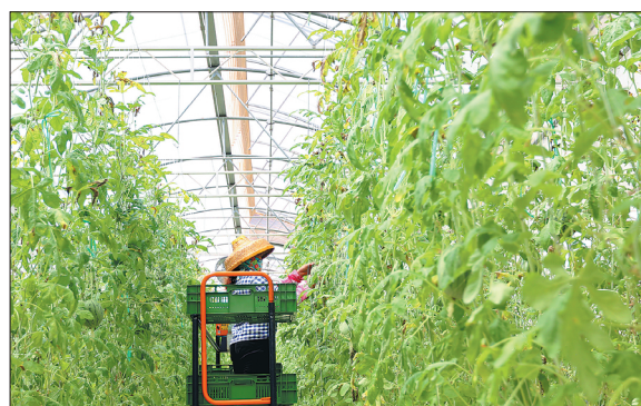
Lingshui modern agriculture demonstration zone in Hainan is a national-level modern agriculture industrial park.

China in the new era: beautiful new Hainan, shared new opportunities