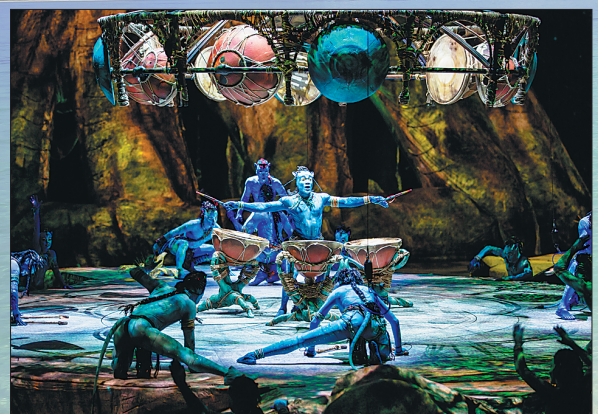
Spectacular and immersive multimedia show Toruk — The First Flight is staging in Sanya for three months from Feb 1.

Hot spring treatments are also on the rise in Hainan. There are a total of 34 hot spring locations distributed across the whole island. A number of hot spring resorts have been set up. Hilton is one of them. It has opened a branch in Baoting autonomous county of the Li and Miao ethnic groups, one of the famous hot spring tourist destinations in Hainan.