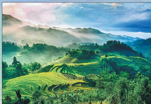
Yahu's terrace in Hainan's Wuzhishan city greets harvest time.