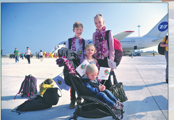
Russian tourists land in Hainan to spend their holidays.