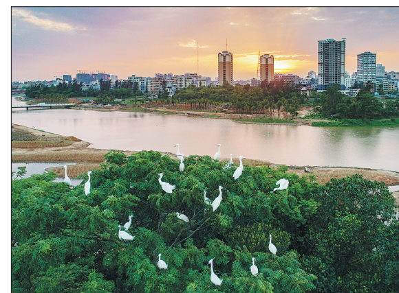
Egrets make their nests at Meishe River Wetland Park in Haikou after a recovery of the ecosystem in the city.