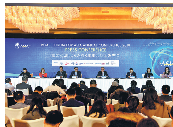
Bo'ao Forum for Asia Annual Conference 2018 was announced to be held in Hainan from April 8 to 11.

To be held from April 8 to 11 this year, Hainan will host 11 themed events, including the 21st Century Maritime Silk Road and Island Economy sub-forum, the ASEAN-China governors' and mayors' dialogue as well as the Hainan promotion conference, which are expected to draw important delegates from