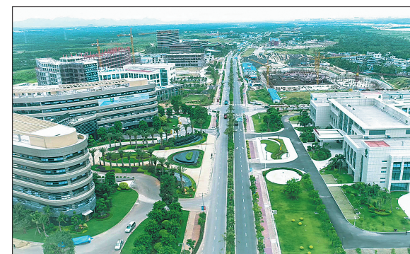
A bird's eye view of the under construction Hainan Boao Lecheng International Medical Tourism Pilot Zone project.

The super hospital will help Hainan take advantage of the growing trend for medical tourism, Shen added.