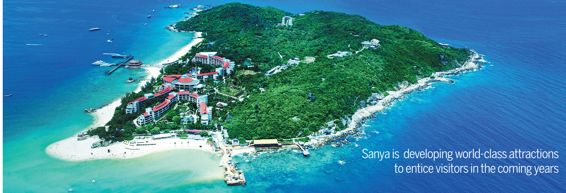
Wuzhizhou Island, 30 kilometers north of Sanya, attracts thousands of tourists from home and abroad every year.

Sanya is developing world-class attractions to entice visitors in the coming years