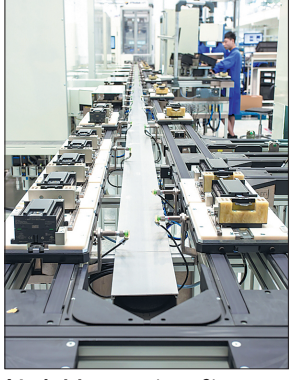
China production line at the company's R&D base in Chengdu

system. Volvo's Chengdu plant manufactures Volvo 60 series products, which are supplied to the United States and the Asia-Pacific region.