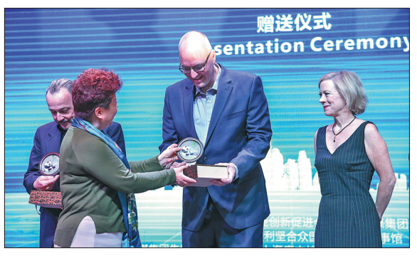
A group of Hollywood directors and filmmakers visit Chengdu and receive gift of Sichuan silk.

The number of foreigners liv ing in Chengdu is nearly 20,000. To make their lives easier, the local government has provided English-language TV programs a mayor's hotline and handbooks about accommodations and public affairs in Chengdu