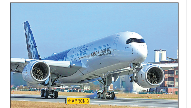
A new Airbus A350 model arrives in Chengdu for display