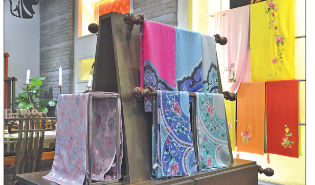
Sichuan brocade has had a huge influence on the development and prosperity of the Chinese brocade industry.

Sichuan brocade has had a huge influence on the development and prosperity of the Chinese brocade industry. Sichuan brocade is therefore dubbed "mother of all brocades". for Bashu Cultural Studies of Sichuan Normal University, said the Qin