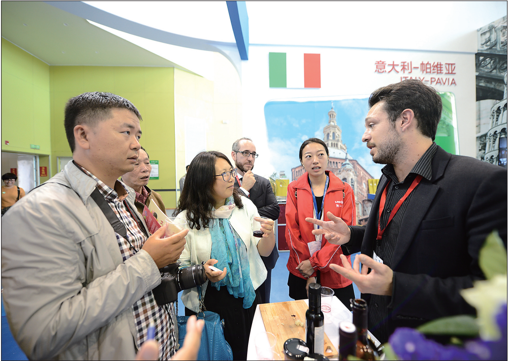
A business representative from Italy introduces wines produced by his company to visitors at last year's China Marine Economy Expo.