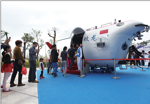
The Jiaolong manned submersible is the most eye-catching exhibit at the expo.

The bureau said Zhanjiang-invested projects in ASEAN are mainly focused on aquaculture feed production, poultry and cattle feed processing, sugar cane farming, sugar processing and education, banking on the city's strengths in these sectors.