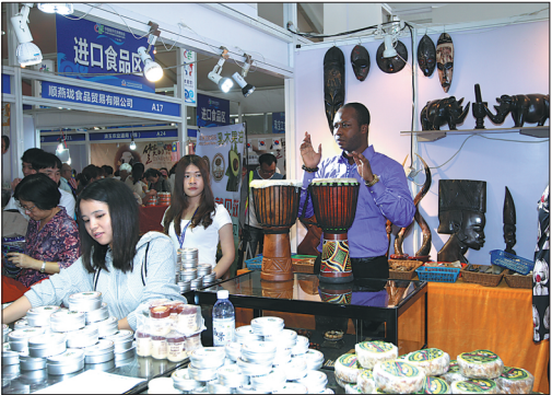
Handicrafts from countries along the Silk Road Economic Belt and 21st Century Maritime Silk Road are exhibited at the event in 2015.

ers and scientists engaged in Antarctic research will work with students at schools in Zhanjiang to promote awareness of their fields.