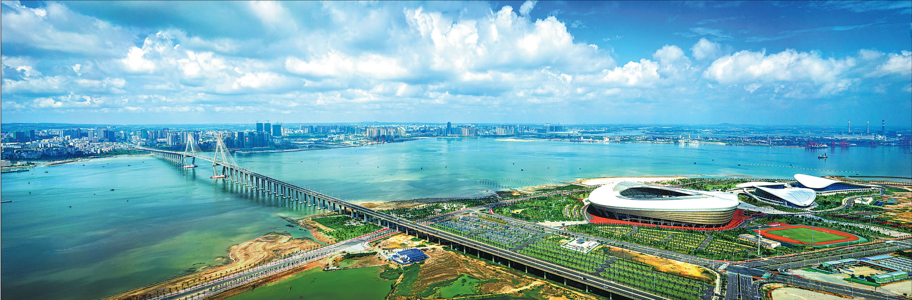
Zhanjiang bay in Guangdong province. The city aims to enhance cooperation with ASEAN members in port logistics, marine economy and tourism.