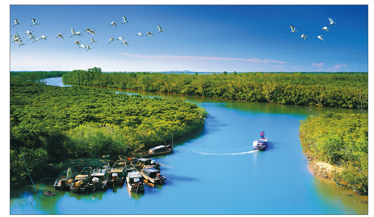
The Dongzhaigang Mangrove Forest Reserve, in Haikou, Hainan province, is one of the province's scenic highlights and the country's largest mongrove forest

Along with its beach appeal, Hainan has another side to its charm that it wants to show to the world, as Su Zhou and Huang Yi ming reports.