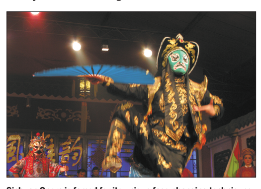
Sichuan Opera is famed for its unique face-changing techniques.