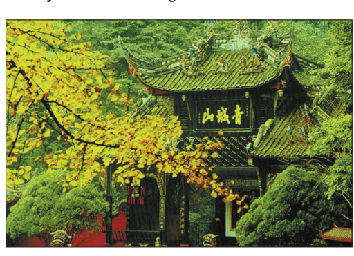
Forest-clad Qingcheng Mountain, recognized as the birthplace of Taoism, is a world cultural heritage site.

which it will choose 10 participants from the 51 eligible countries who want to reach their dreams in the city.