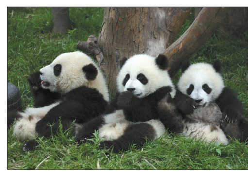
Chengdu is also renowned as the home of the giant panda, an iconic symbol of China and huge tourist draw