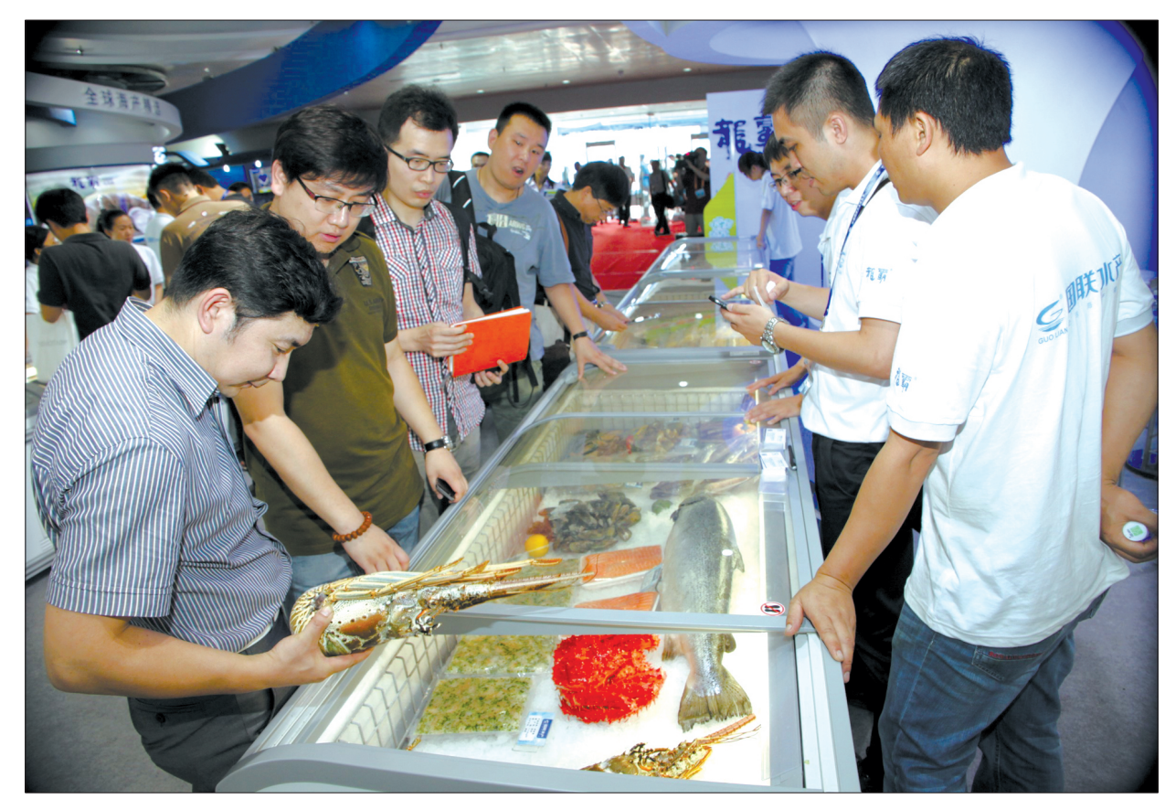
Visitors at the aquatic expo in Zhanjiang, Guangdong province.