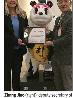
the Chengdu Cuisine Association, gives a panda gift to a representative from payment technology company Visa Inc during the event.

'Our target is to establish cooperation with 1,000 companies in Chengdu."he said, adding that Google is currently helping small and medium-sized enterprises in Chengdu to expand in the overseas