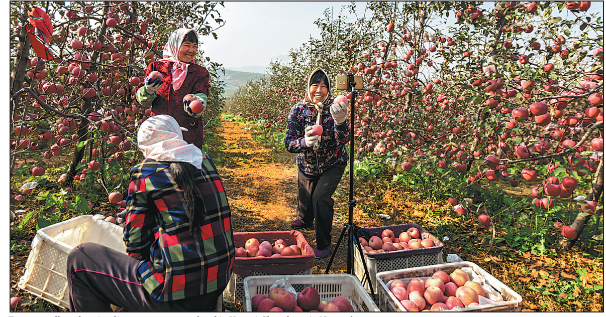
Farmers sell apples via a livestream at an orchard in Yantai, Shandong, in November.

Contact the writers at zhangyunbi@chinadaily.com.cn