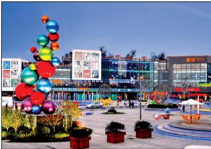
Xinghu 101 Square in the Nantong zone supplies outdoor recreation and entertainment.

The Nantong Economic and Technological Development Zone was one of the first State-level development zones in China, approved by the State Council in December 1984. It now covers a more