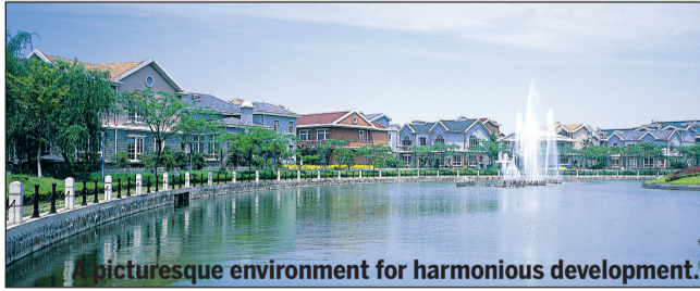
Picturesque environment for harmonious development.

Farmers’ concerns, along with agriculture and countryside life were dealt with in a better way, the local government has said.