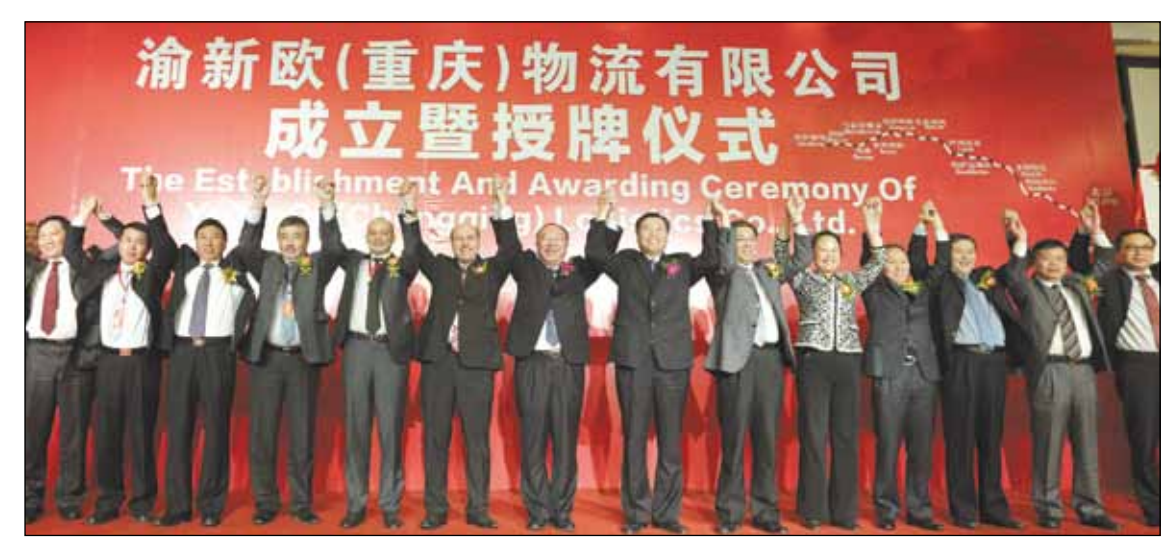
Chinese and foreign delegates celebrate the establishment of a logistics company in Chongging, which has capitalized on the international railway to provide its clients freight services.

Russian and Chinese representatives, including Chongqing Mayor Huang Qifan (third from right), toast the success of the cooperation on the Chongqing-Xinjiang-Europe railway in 2013.