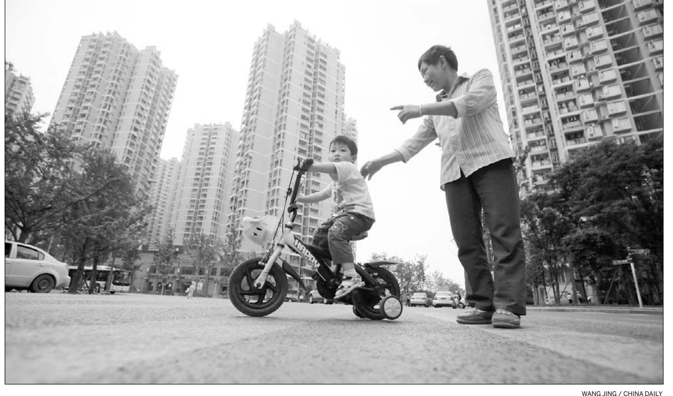
Residents enjoy their leisure time in Minxinjiayuan community, a public rental project in Liangjiang New Area, Chongqing. By 2020, the city aims to have nearly four million more permanent residents in the 1,200-sq-km area.