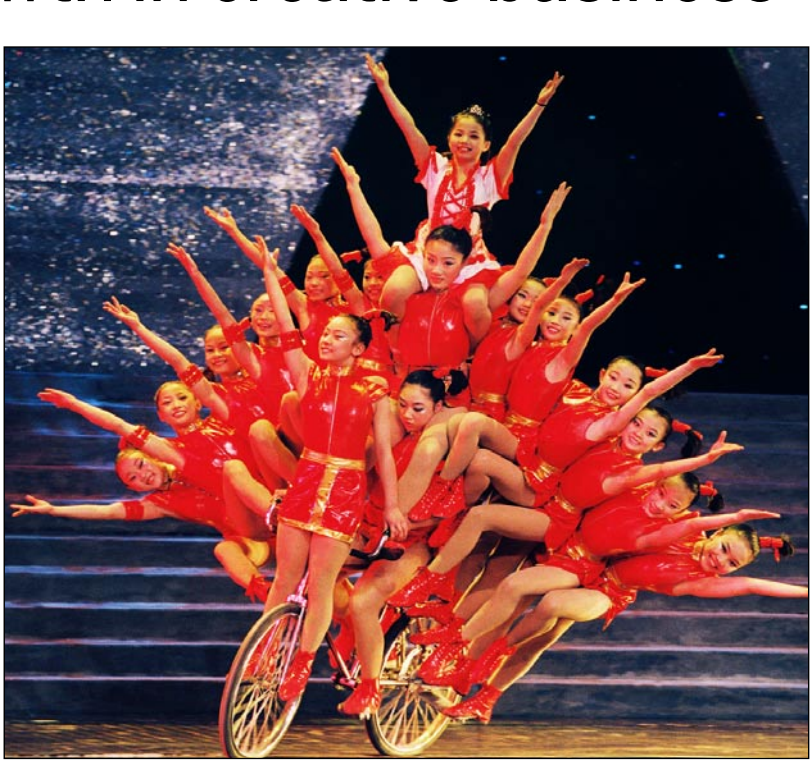
provincial GDP by 2015, and have Acrobatic show staged by local performers.

The folk handicrafts business is also being encouraged, such the stone carvings of Quyang county, paper-cuts of Weixian county, elaborate painting than 5,000 people engaged in the of Ningjin county, and the paintings of Hengshui city — where pictures are put inside semitransparent glass or crystal objects so they are visible from outside.