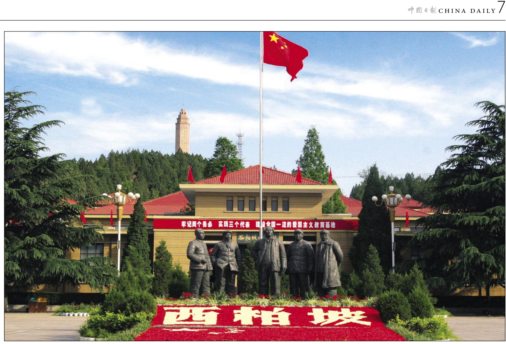
Xibaipo, about 90 km from the provincial capital, Shijiazhuang, is where the Central Committee of the Communist Party of China had its headquarters before liberation in 1949.

The lion dance, a tradition in Chinese culture, often used for festive celebrations