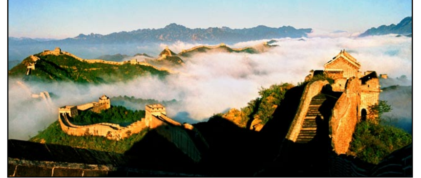
A restored section of the Jinshanling Great Wall in Heibei province.

This area will be built into an environmentally friendly industrial zone and a vocation developing place with a picturesque landscape, centered on Beijing.