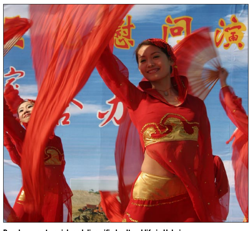
People promote a rich and diversified cultural life in Hebei