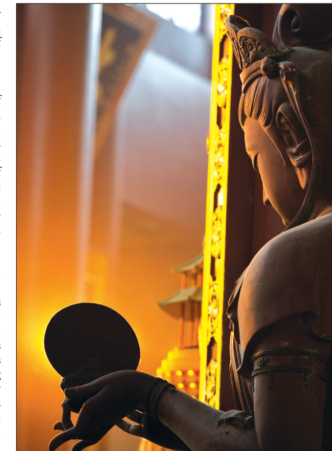
Lingyin Temple, located on the northwest of the West Lake, is