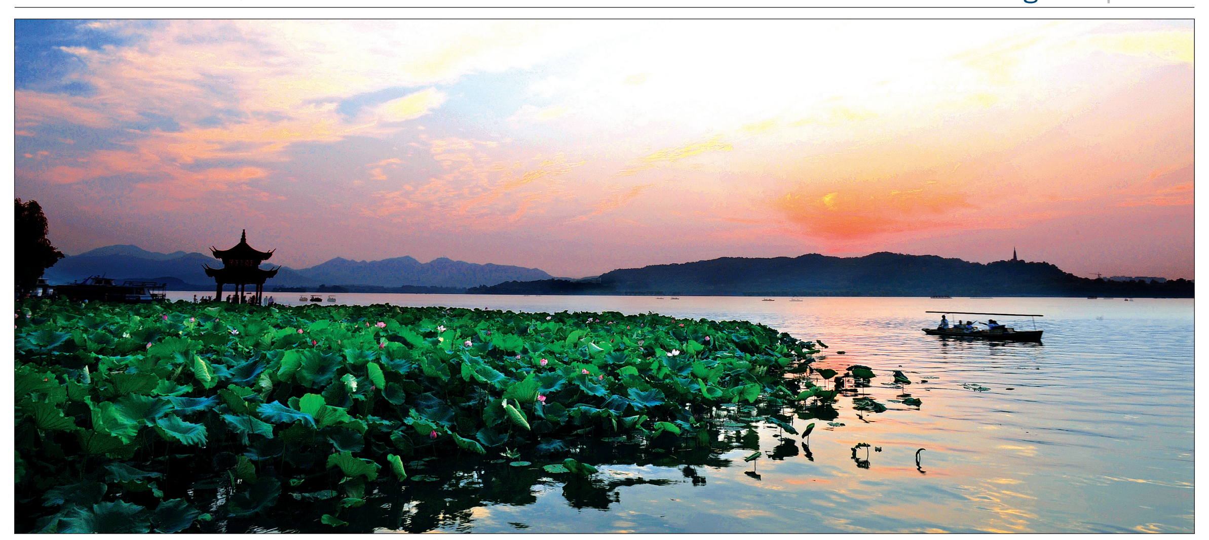
Located in the western area of Hangzhou's historic center, the West Lake is one of China's most renowned tourist spots.