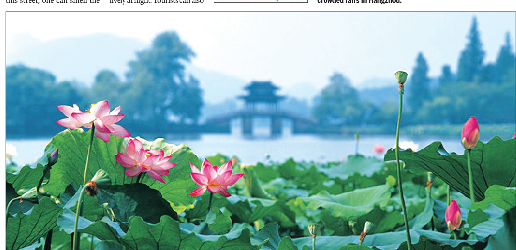
The city is famed for its lotus blossoms, which bloom in summer.