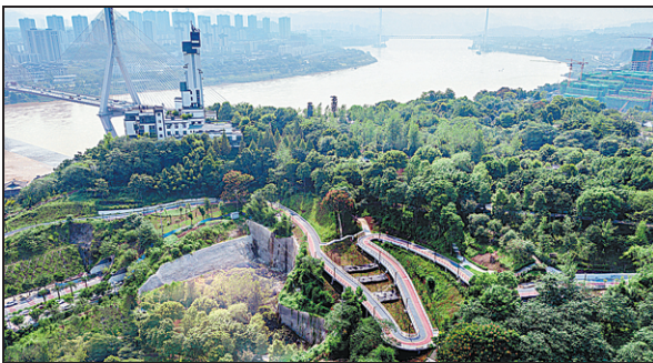
An aerial view of a section of Cliff Trail Park in Chongqing.

The red and gray trail — which is designed for walking, jogging and cycling, and is wheelchair accessible along the main section — is one of 60 featured trails planned by the