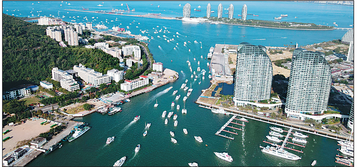
Clockwise from above: Yachts sail out of a marina in Sanya, Hainan province. Tourists participate in a scuba diving tour to plant coral off-shore near Sanya in January. Visitors learn to surf on a beach in Sanya.