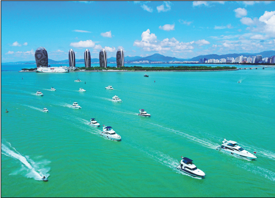
From left: Tourists enjoy yacht rides in Hainan province. Local residents perform a bamboo dance to welcome visitors.