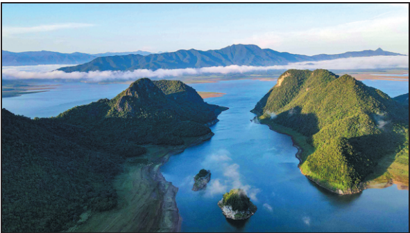
Hainan's natural beauty is clear to see.

In the past three years, local scientists have observed at least 28 new species in the tropical rainfor-