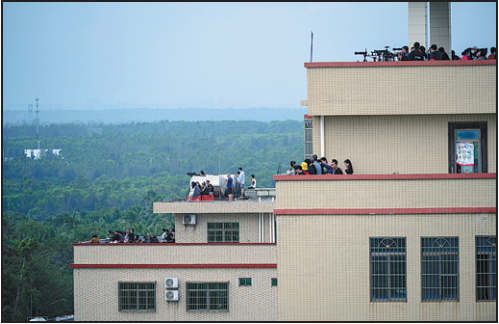
Tourists observe the launch of a Long March rocket in Wenchang, Hainan province on December 23, 2021.

port at the southern tip of Hainan island, and then transfer to Wenchang via a high-speed loop railway, the only one that circles a tropical island in the world. It takes bullet trains leaving Meilan, Haikou only 17 minutes to reach Wenchang station while a bullet train from Sanya Phoenix takes just over one hour. Local travel agencies operate tourism routes that take visitors to officially designated viewing points and other natural and cultural attractions. Visitors also have the option to turn to app platforms to rent vehicles to drive to the space launch site and other tourist