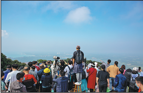
Space fans at seaside launch viewing points.

Visitors from outside Hainan can arrive at Haikou Meilan International Airport in Haikou, the provincial capital, or at Sanya Phoenix International Air-