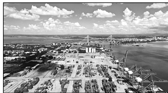
From left: Customers choose commodities in a duty-free shopping center in Haikou, Hainan province, in May. Traders display ham from Spain at the second China International Consumer Products Expo in Haikou, on July 25. Containers wait to be shipped at the Yangpu Port in Hainan.