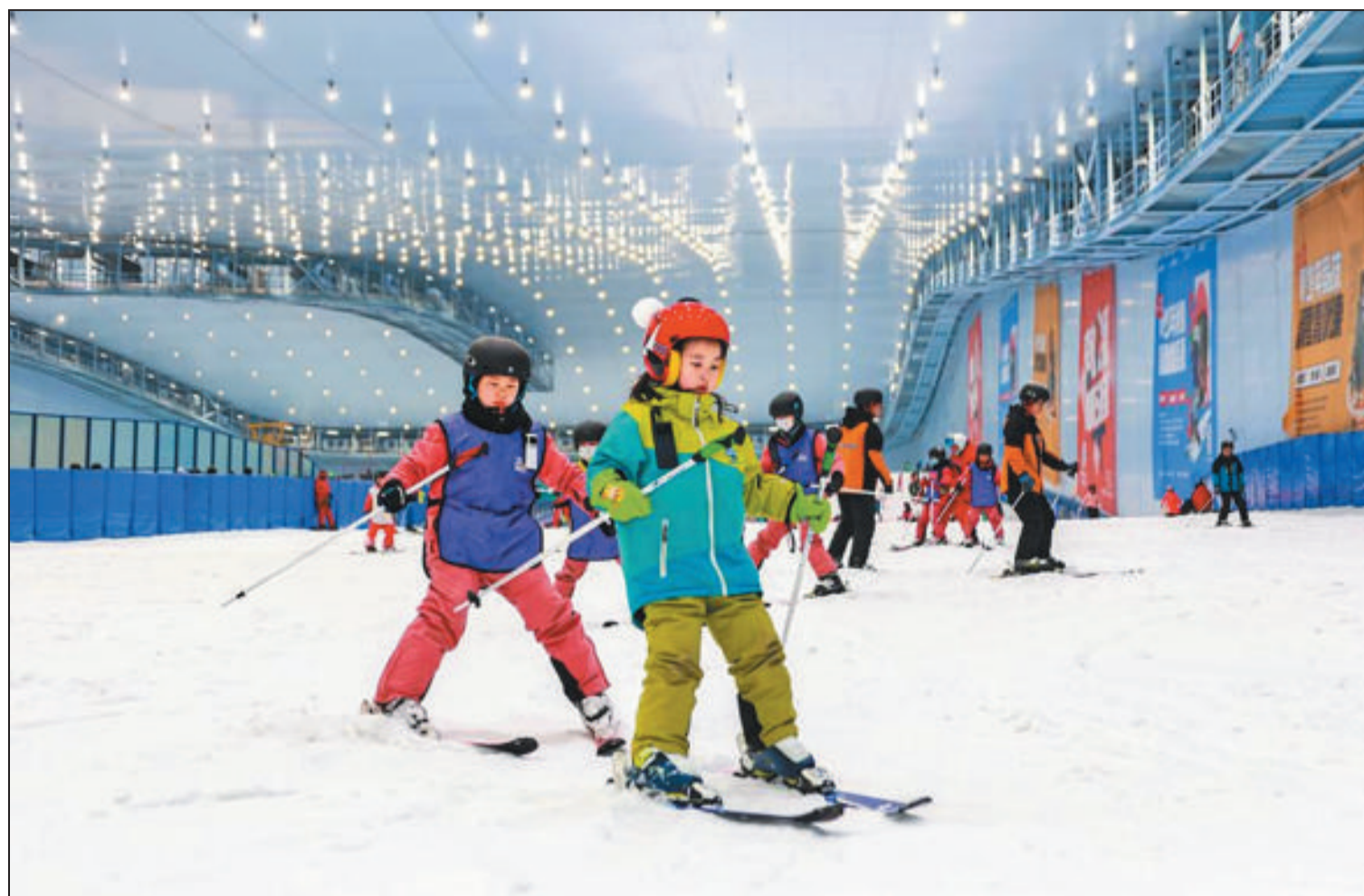
Children learn how to ski at Chengdu Sunac Snow World in Dujiangyan, Sichuan province, on Tuesday. The ongoing Beijing 2022 Winter Olympics are playing a significant role in generating greater interest in the winter sports market.