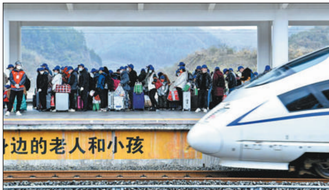
Migrant workers wait in line on Tuesday at a railway station platform in Zunyi, Guizhou province, before boarding a train to return to cities where they work. Railway authorities gave more than 600 workers from the city free tickets to return to Guangzhou and Zhuhai in Guangdong province.

See related story, page 4