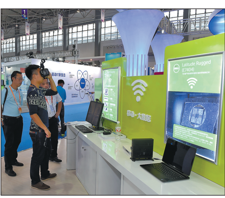
Visitors at the international big data conference, which opened in Guiyang, Guizhou province, on Tuesday. Uber is in talks with the Guiyang government for taxi-hailing services.

close details of the proposed partnership, but Kalanick said that creating jobs will be one factor that attracts officials. Uber entered the Chinese mainland more than a year ago, and it is operating in nine cities including Beijing, Shanghai, Shenzhen and Wuhan, the capital of Hubei province. Many Uber rivals are also