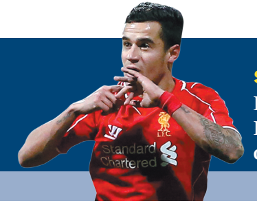
图 4 载 CHINA DAILY » CHINADAILY.COM.CN/SPORTS