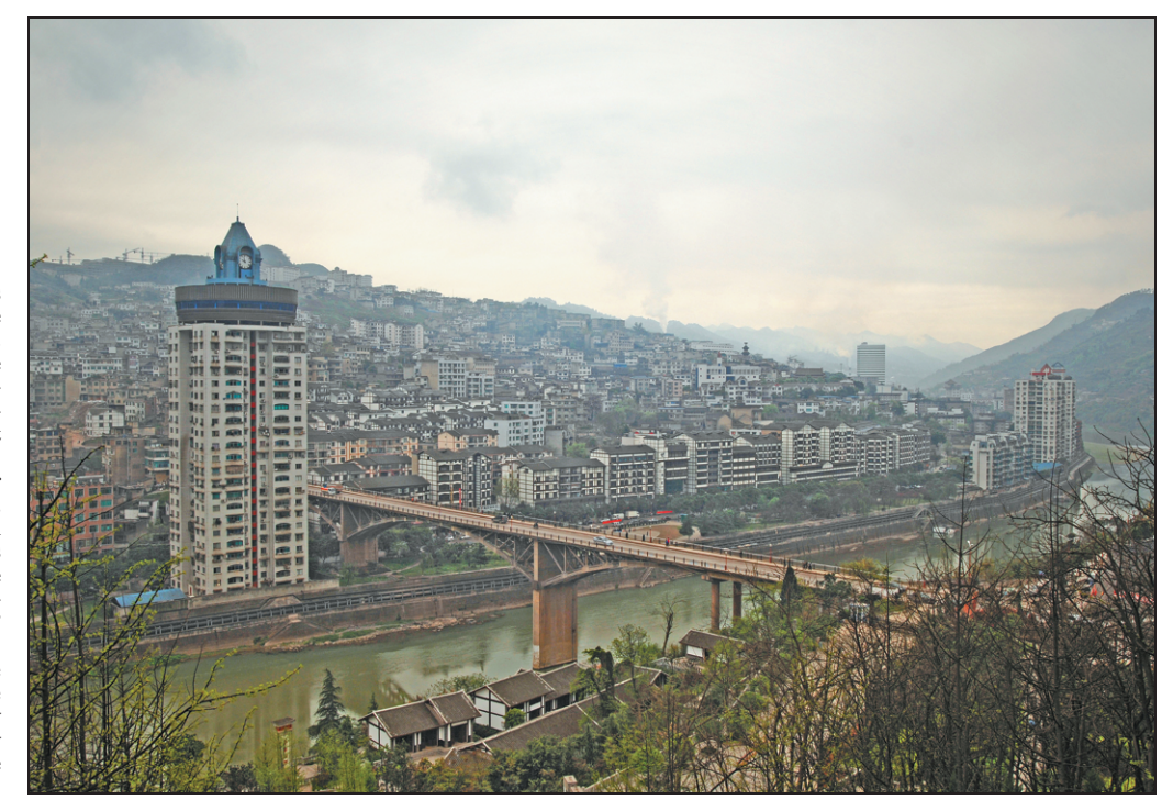
The Chishui River runs through Maotai Town in Guizhou province. Spirits giant Kweichow Moutai Co Ltd will provide 500 million yuan ($81 million) over the next 10 years to protect the river, a water source vital to the company's development.