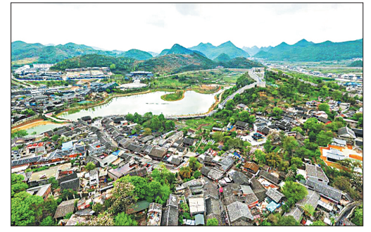
Qingyan town , built more than 600 years ago in Guiyang, Guizhou province, is a popular attraction in the provincial capital.