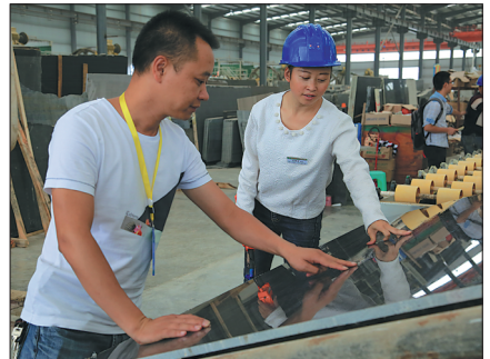
A worker at a Chenchun plant shows a visitor the high-quality marble slabs that are produced by the company.