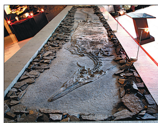
New China Dragon: It is unearthed in Guanling county and is said to be the fossil of an ancient marine reptile that lived around 220 million years ago.

A number of locally produced precious stones are displayed in the 10 exhibitions halls, with those produced in Machang township, Puding county, featuring a great variety of colors and patterns.