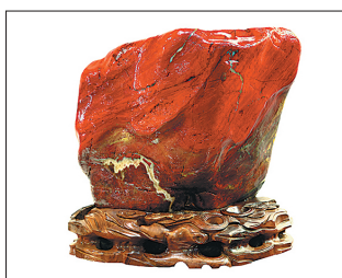
Flying Red Flag: The upper portion of the stone is reminiscent of the color of the national flag. This is a "national red" stone that is native to Machang township.