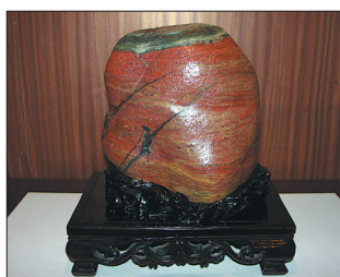
Flying Chang'e: The stone discovered in Machang township is so named as its grains resemble a fairy from Chinese legend.