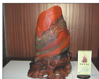
Robe of the God of Longevity: The stone has several colors, resembling a robe that is worn by the god according to legends.