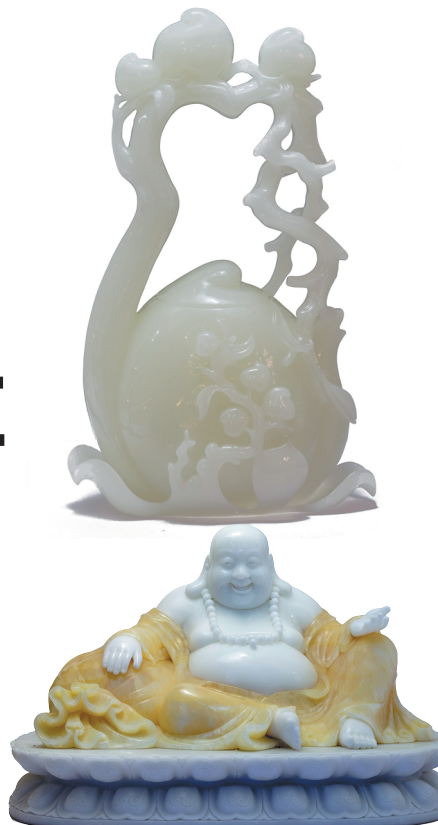
Stone craftworks created by artists from Anshun and across China are displayed at the first Guizhou International Stone Exposition.