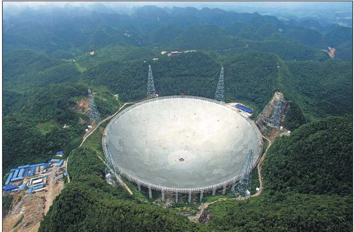
he Five-Hundred-Meter Aperture Spherical Telescope in Pingtang county, Guizhou province, could be operational in September.