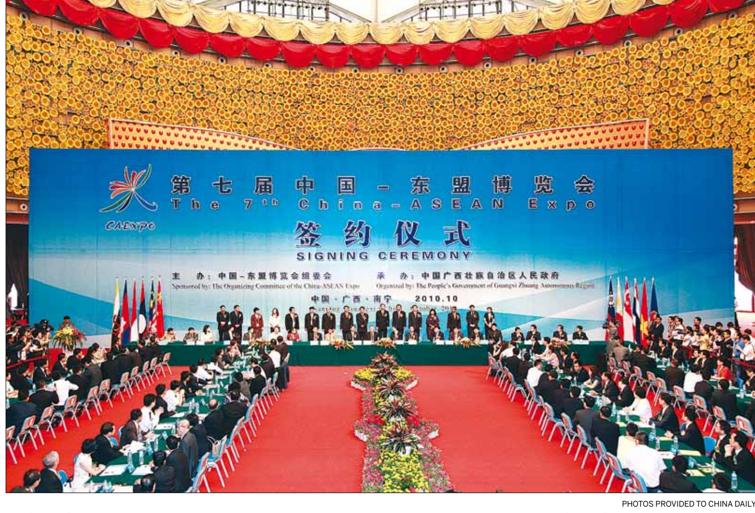
The China-ASEAN Expo provides opportunities for companies looking for new business and plays an active role in China-ASEAN exchanges.

Another example was a logistics forum, in November, 2006, which