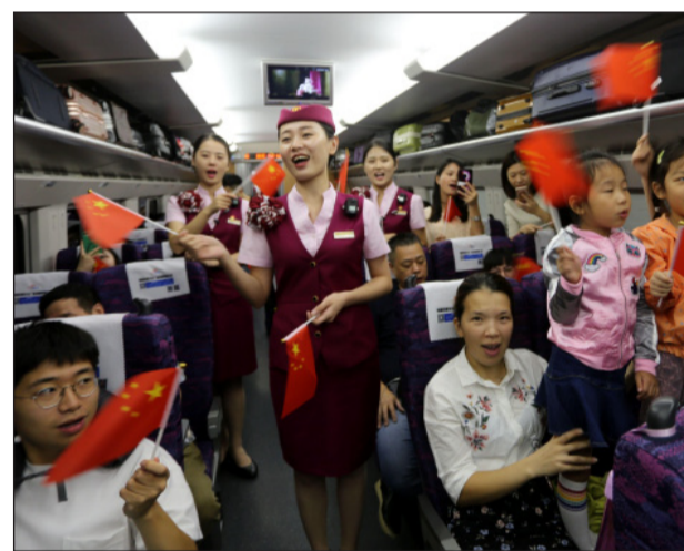
Clockwise from top: Yu Weiguo, Party secretary of Fujian province visits the Hong Kong Science Park on Oct 8. Yu shares his views at a seminar during the event. Passengers take the first high-speed train from Fuzhou to Hong Kong on Sept 23. Participants of the HK Federation of Fujian Association enjoy their day during the event.