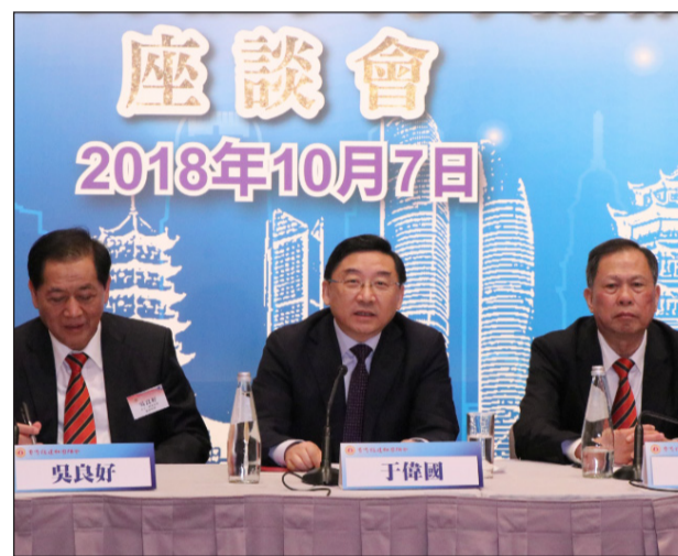
HU MEIDONG / CHINA DAILY