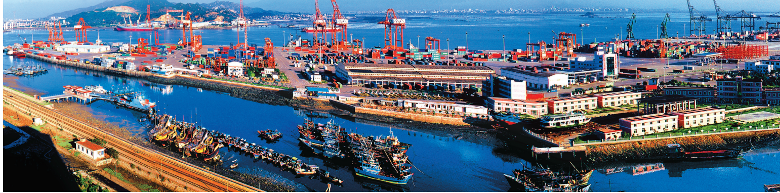
The view of the Dongdu port in Xiamen.

Officials added that during the visit the delegation would sign a batch of important economic and cultural cooperation projects, which would put greater efforts into building a "new" Fujian.