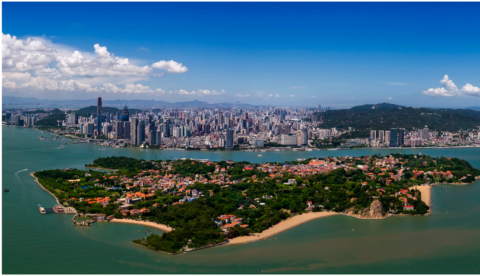
The view of Gulangyu Island, an island off the coast of Xiamen, Fujian province.