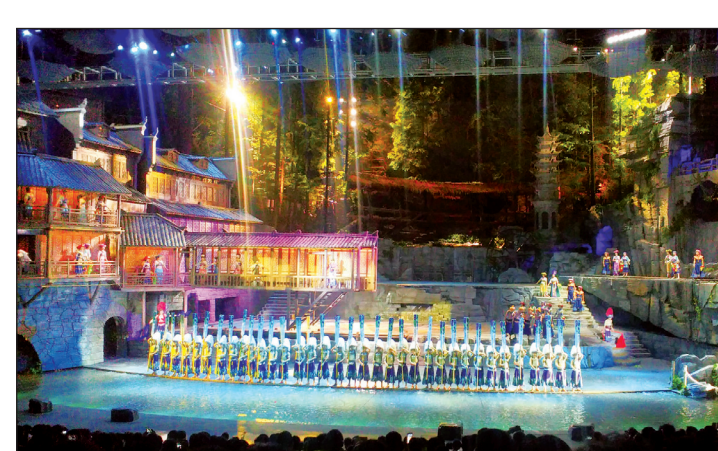
The Border Town is adapted from a classic novel.