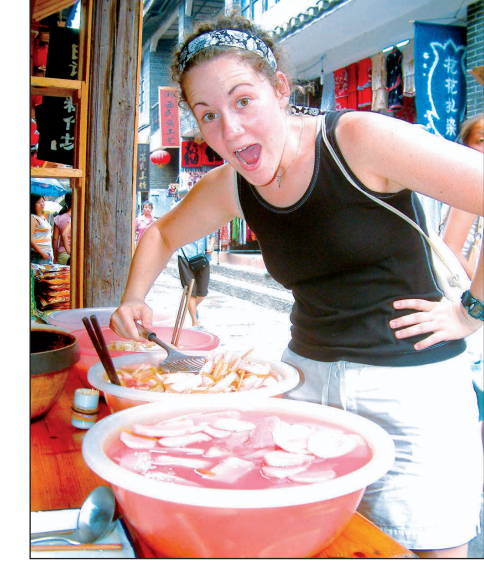
A foreign tourist tastes pickled radish, a popular local snack.

relaxing in bars and taking photographs, and shop owners smilingly welcome new guests.