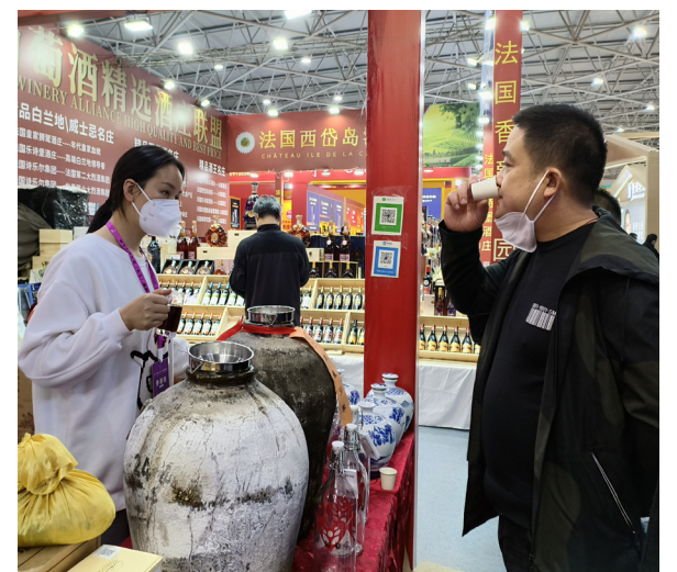
▲ Exhibitors Introducing Alcoholic Beverages

Construction commenced for the CIABE City. Located in Guiyang Southwest International Trade City, the CIABE City will be developed in three phases. In the first two phases, commercial facilities with an area of about 300,000 m 2 and 700,000 m 2 , respectively, will be completed. The third phase will involve the construction of an industrial park with about 333,000 m 2 . After completion, the CIABE City expects to bring together local sauce-flavor liquors as well as other famous alcoholic beverages from home and abroad, presenting a panorama of the global wine industry.