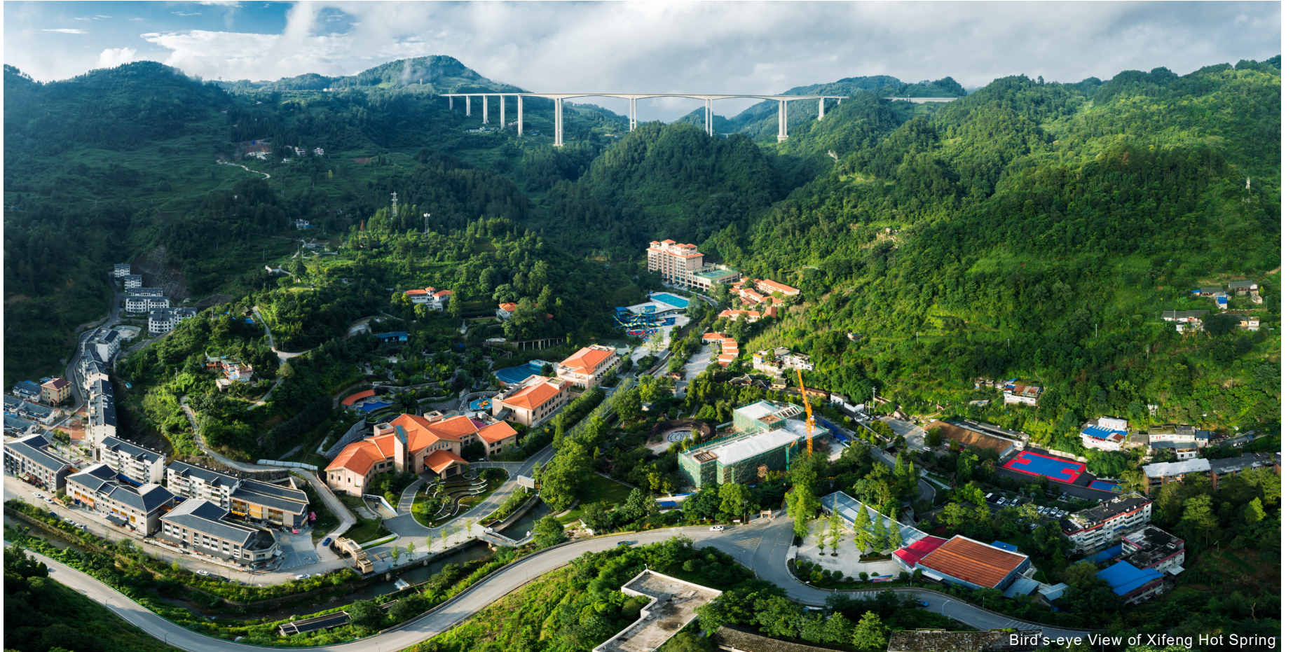
Bird's-eye View of Xifeng Hot Spring

“Cool Guiyang” is not only an ideal place to escape the summer heat, but also a warm destination to escape the bitter cold of winter. Guiyang launched warm and refreshing hot spring series activities consisting of cultural events, family tours, wellness tours, mountain exploration trips, and quality homestay inns, and rolled out policies to enable more people to enjoy winter fun in Guiyang.