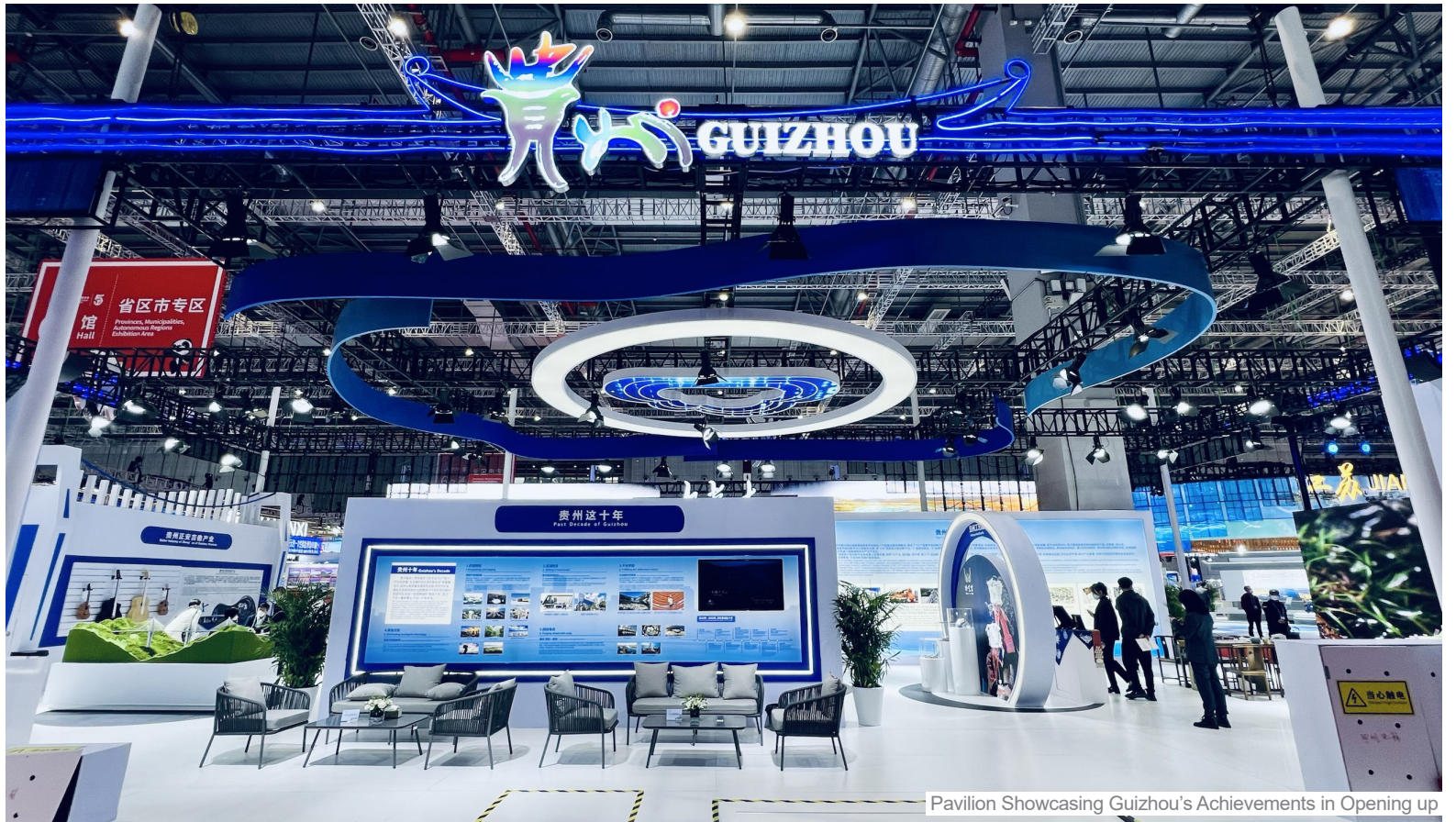
Pavilion Showcasing Guizhou's Achievements in Opening up

A fascinating array of products ranging from Guizhou tea, Lao Gan Ma, big data, to chassis for automated driving were on display at the fifth China International Import Expo (CIIE) held in Shanghai. The Expo offered guests from all over the world a glimpse into “colorful Guizhou” and “cool Guiyang”, acting as a great opportunity to boost economic cooperation and common development.