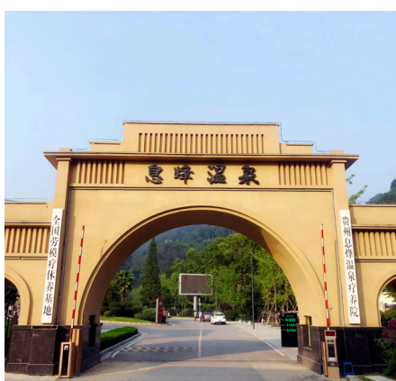
▲Xifeng Hot Spring

Xifeng Hot Spring is located in Wenquan Town, Xifeng County, 111 kilometers from downtown Guiyang. It is one of the eight most famous hot spring sites in China and recognized by some as the best. According to test results, the hot spring here is a heavy- \text{CaCO}_3 radon spring with metasilicates and strontium. The water offers many health benefits and stays at 53-56°C throughout the year.