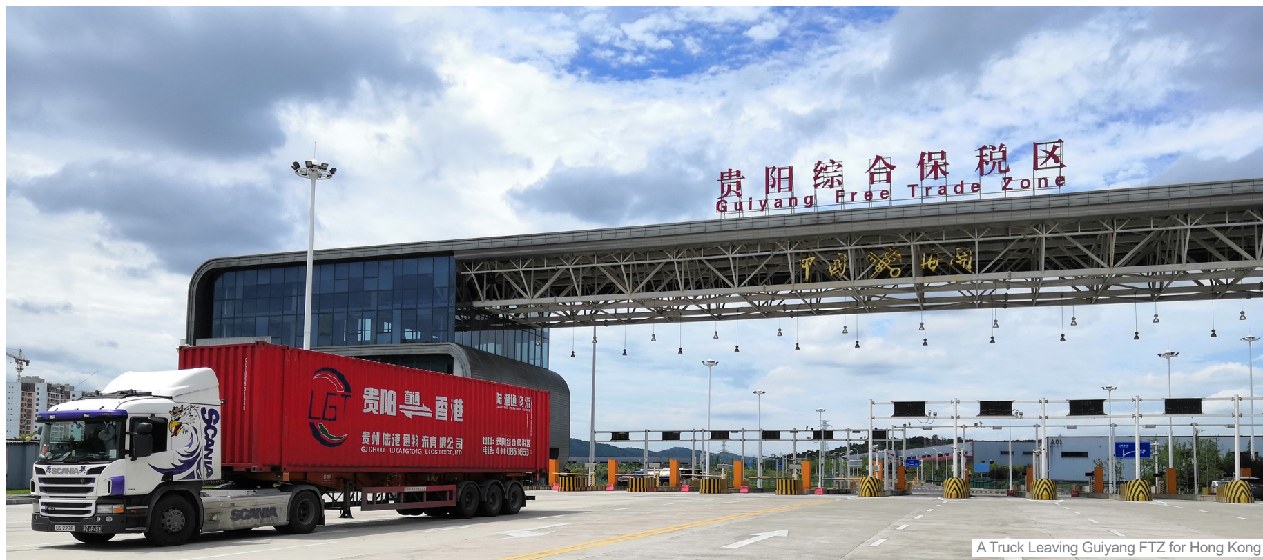
A Truck Leaving Guiyang FTZ for Hong Kong

Eight authorities including the Ministry of Commerce and the National Development and Reform Commission decided to set up 29 national import promotion and innovation demonstration zones. Guiyang Free Trade Zone (FTZ) was included in the list, becoming the first in Guizhou Province to receive such a designation. These demonstration zones are expected to play an exemplary role in two aspects: trade promotion (i.e. promotion of imports, industries, and consumption) and trade innovation (i.e. innovation in trade policies, services, and models).