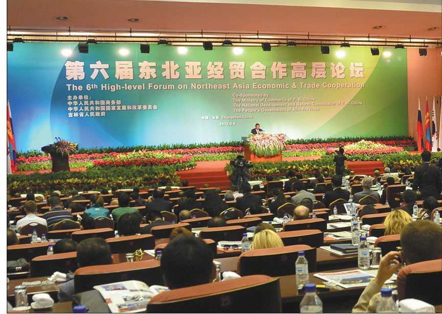
The sixth High-Level Forum on Northeast Asia Economic and Trade Cooperation. The forum is an annual event held concurrently with the expo.