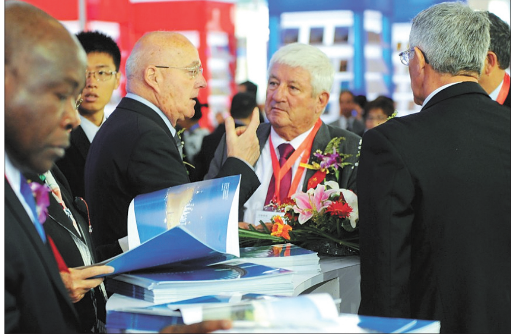
Foreign exhibitors and visitors flock to the China-Northeast Asia Expo, which offers a variety of opportunities for them to get to know Jilin as well as China.