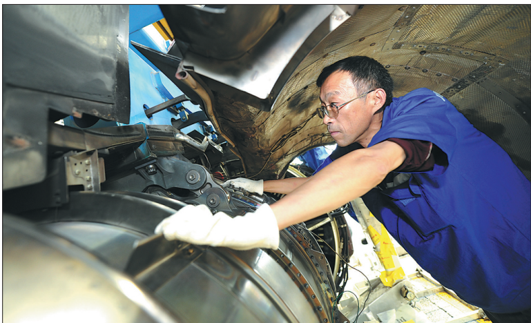
Aircraft maintenance is a key industry in the Shuangliu Southwest Airport Economic Development Zone.

He said Shuangliu is a satellite city of Chengdu. It has a good ecology, high-quality and cost-effective living communities and shares all educational, scientific and cultural resources with Chengdu, which are all factors attracting investors and professionals from home and abroad.