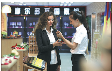
Quality products and premium brands from many countries are available in the exhibition and sales center for consumer goods (right) or the Times Outlets, both in the development zone.