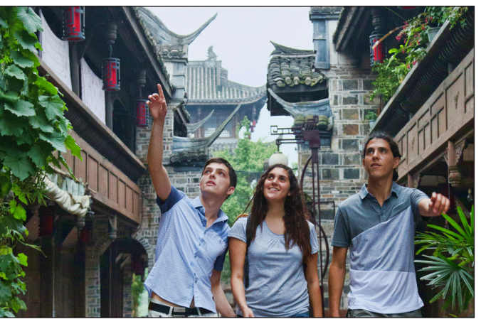
Jinli Old Street, also known as Chengdu's snack street, is a must-see for tourists from around the world.