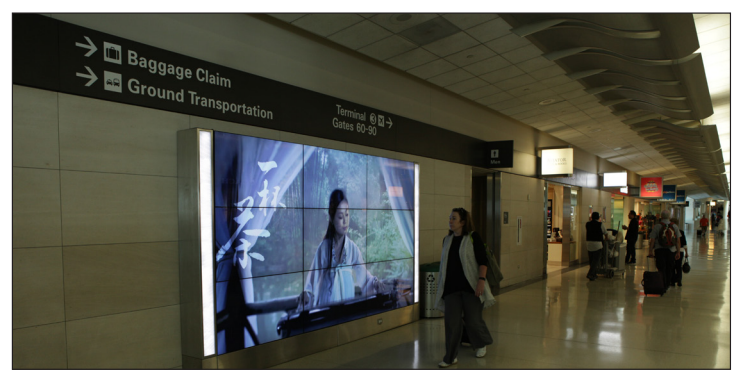
The 30-second video on Chengdu tourism is also shown in San Francisco International airport.