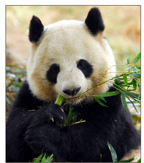
As the natural habitat of the giant panda, a visit to Chengdu offers the chance to get up close and personal with these cute animals.