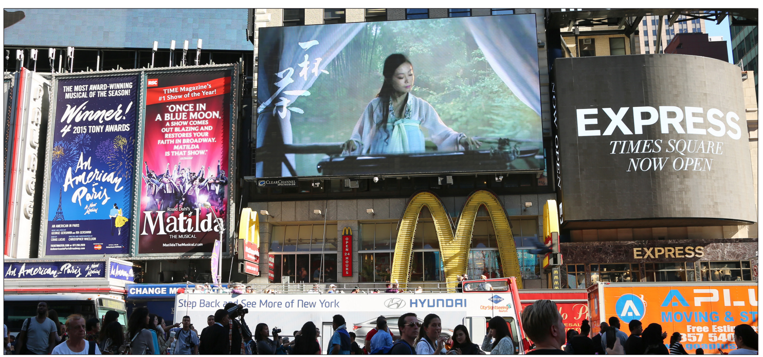
A promotional video on Chengdu's tourism has been playing on huge screens in Times Square in New York since Oct 14 and lasted for a week

attention from visitors. The pictures were shown during a