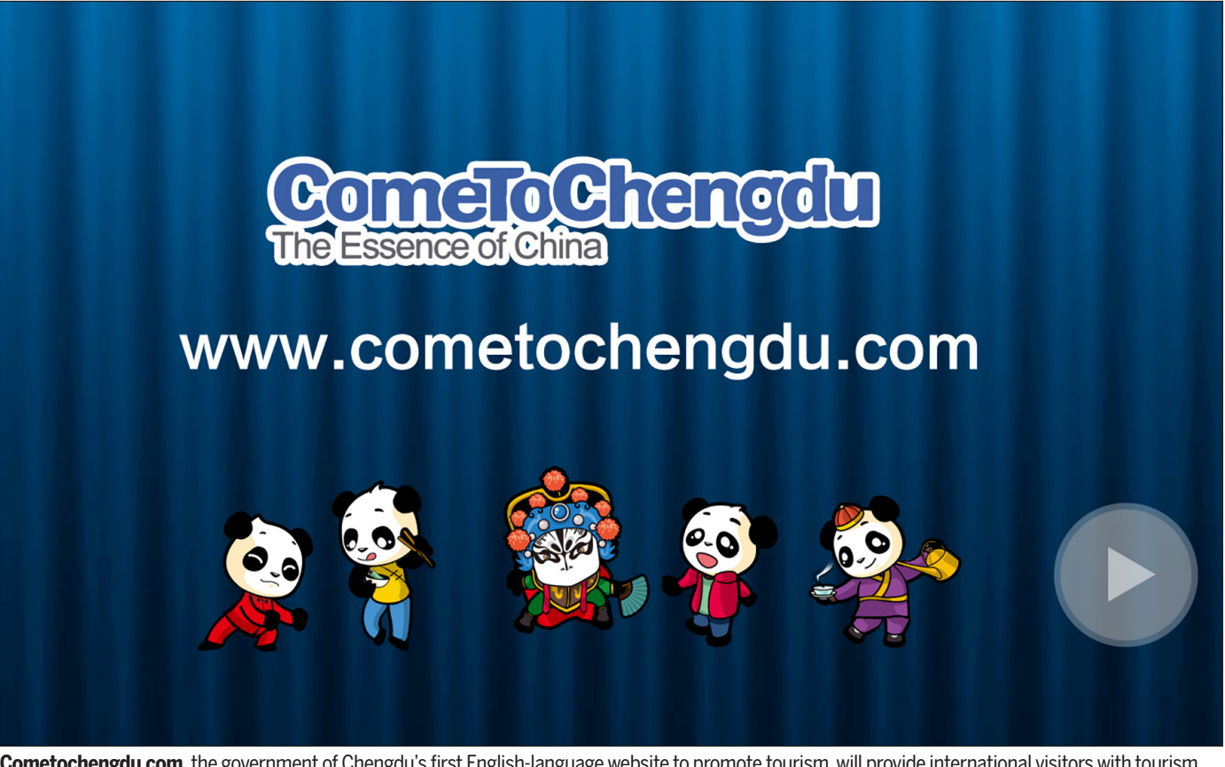
Cometochengdu.com, the government of Chengdu's first English-language website to promote tourism, will provide international visitors with tourism information and services on the city and its nearby areas.

"We aim to turn cometochengdu. com into an encyclopedia on tourism in Chengdu that includes every detail, so every foreign visitor could become a 'Chengdu expert'," said a Chengdu Culture and Tourism Group official.