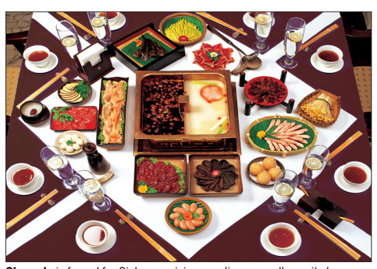
med for Sichuan cuisine, a culinary excellence it share