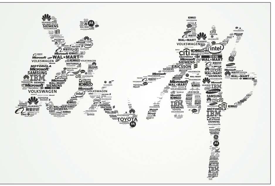
The characters for "Chengdu" made up of the logos of multinational companies in the city.