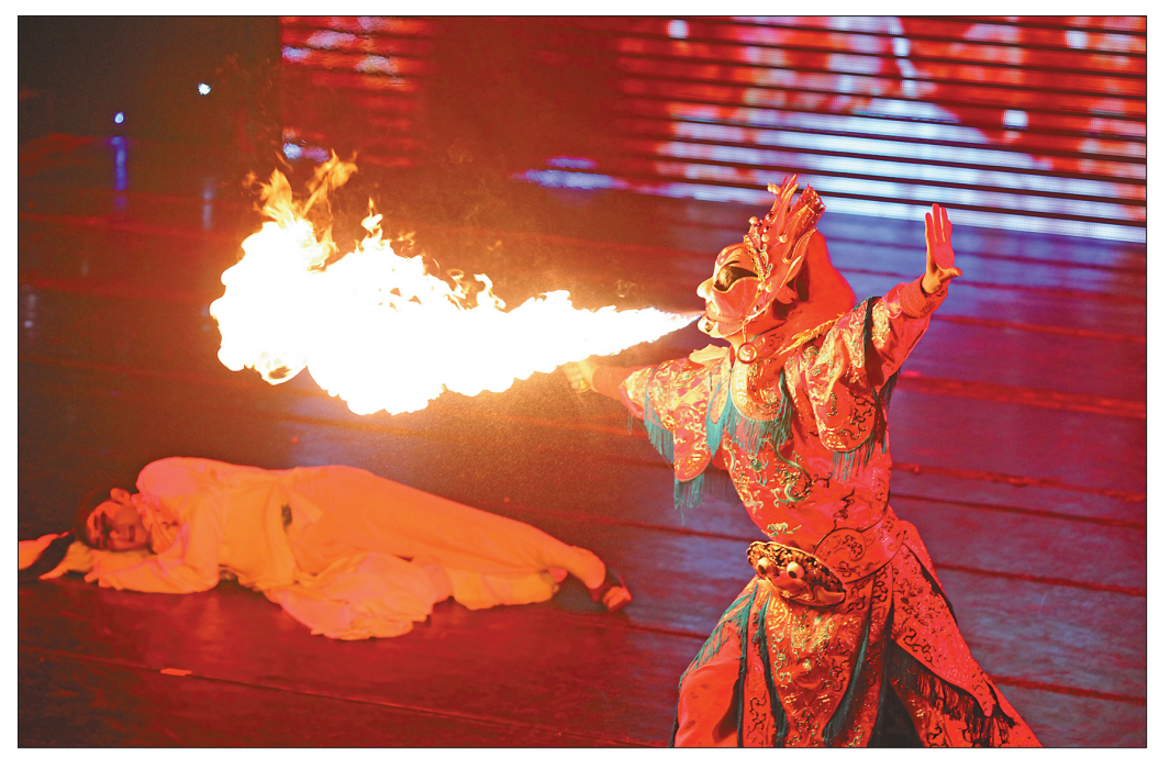
Fire 'breathing' in Sichuan Opera is usually followed by the face-changing display for which it is renowned.