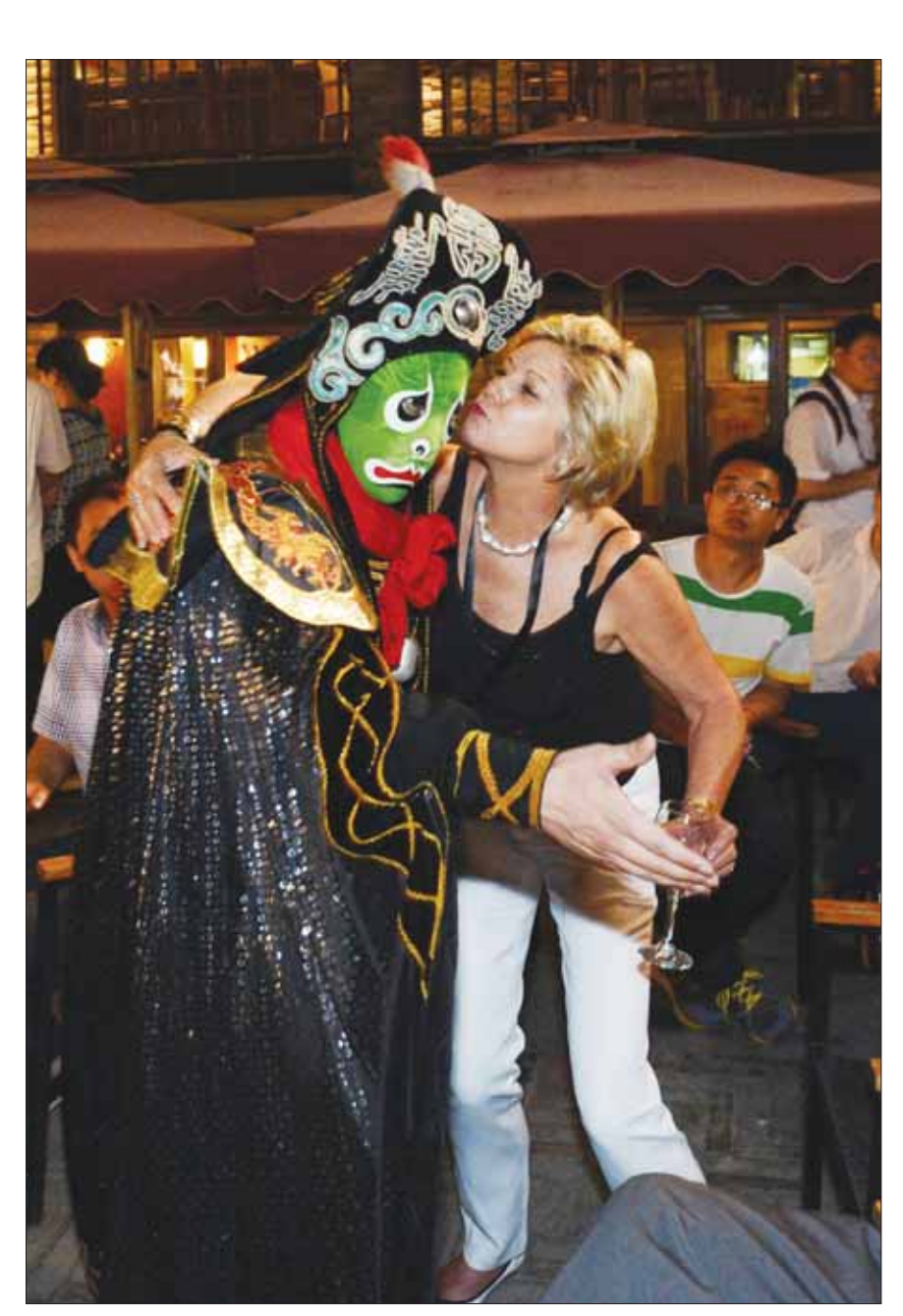
\label{thm:continuous} A \ female \ participant \ in \ the \ event \ kisses \ the \ mask \ of \ an \ actor \ at \ a \ restaurant \ in \ Kuanzhai \ Xiangzi.