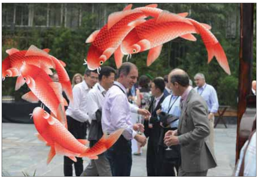
Forum participants still share their ideas during their visit to the city.