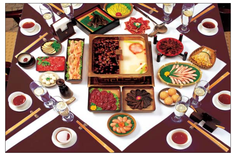
Sichuan hotpot is a colorful feast for the senses.

Address: Daguan, Qingchengshan Telephone: 028-87170000 Price: 800 to 1,100 yuan