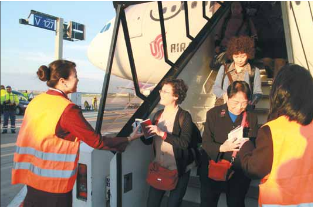
Air China launched a new direct route from Chengdu to Frankfurt, Germany, on May 19.

There are four road transportation terminals - Xin-