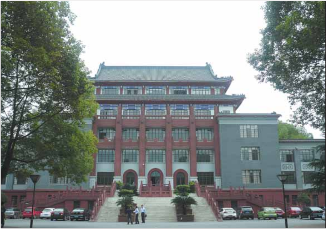
Sichuan University, built in 1896, is an example of Chengdu's excellent educational resources. The faculty environment at Sichuan University and the city's other research institutes is attractive to elite experts and researchers.

The train left Chengdu's Qingbaijiang Railway Station on the evening of April 26 with 41