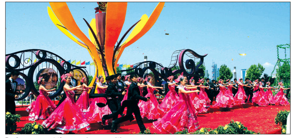
Performances at the on-going exposition.

Sun from the wine association said "10 more chateaus will be built in Yantai by 2015 targeting the high-end wine market and further promoting wine-themed tourism".