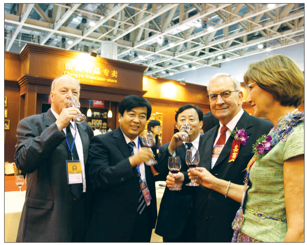
International aficionados taste Changyu wine at the on-going exposition.