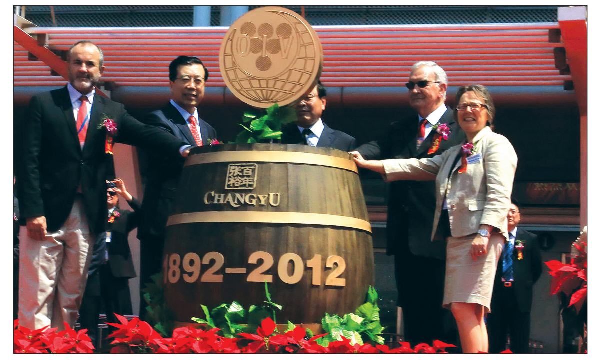
Government officials and international guests attend the opening ceremony.

"Although the wine market in china is fast growing, it still needs time for Chinese to understand wine culture. I hope they can learn to enjoy diverse wines with different food and drink some wine everyday," he said.