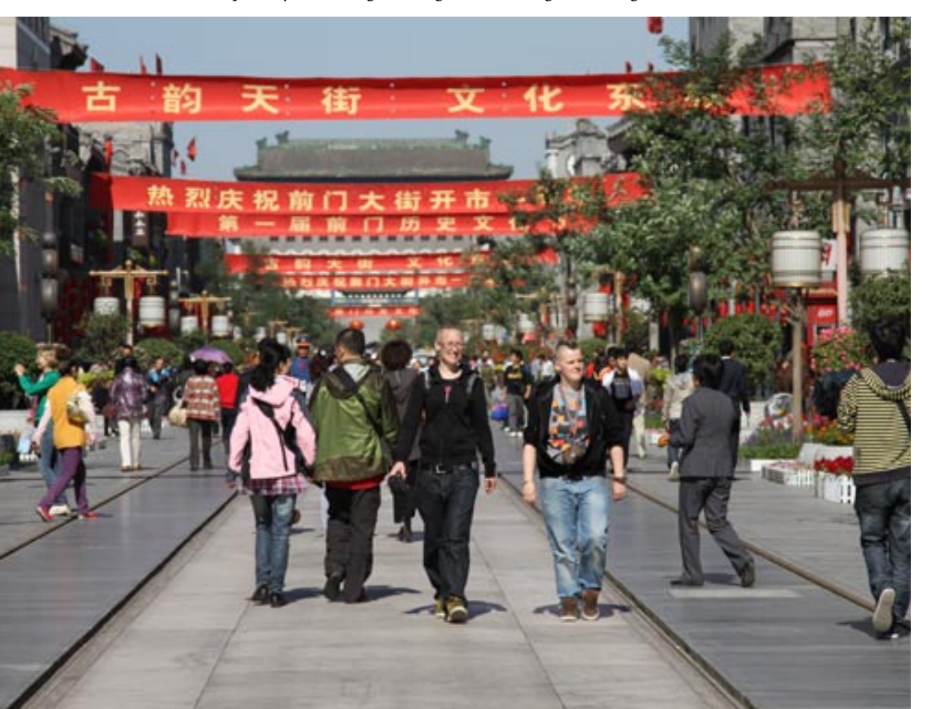
A trip out of the Zhengyang Gate gives tourists a vivid picture of the local life of the past and present Beijing.