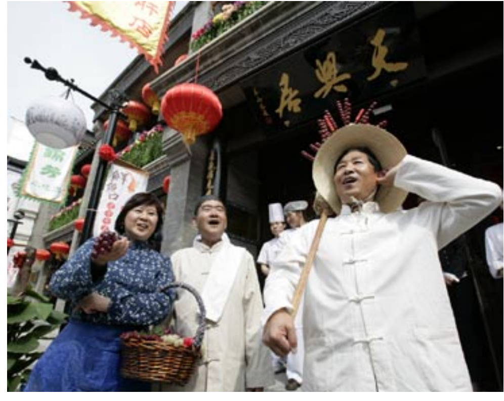
Peddling goods by chanting is a unique art for vendors at the street.

The 35 old brands on Qianmen Street today also enjoy lowered rents or are even exempt from property management fees that would normally total as much as 60