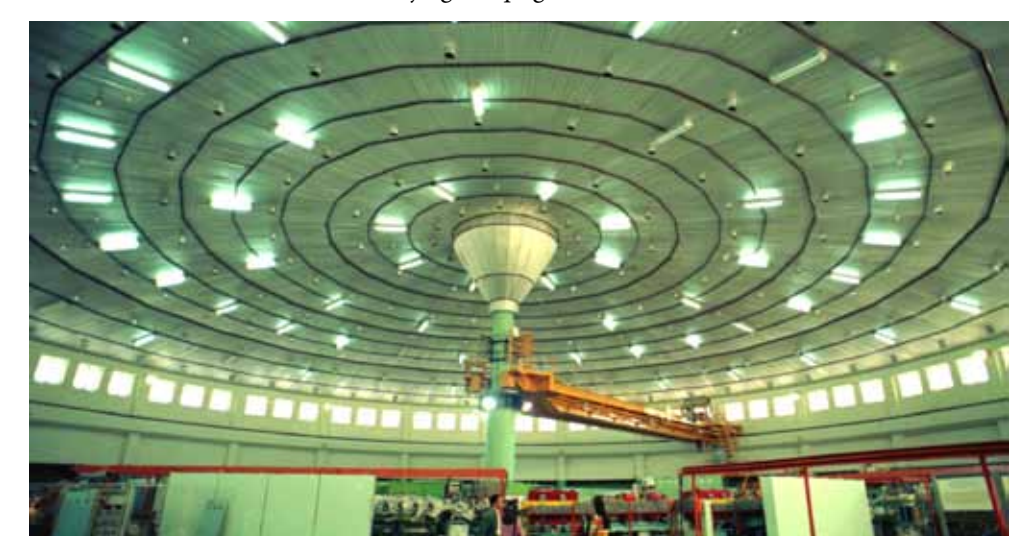
Synchrotron radiation lab in Hefei, one of the facilities representing leading-edge frontier sciences in Anhui.

The 400-km watercourse of the Yangtze has ports at Anqing, Tongling, Wuhu, Maanshan and Chizhou.