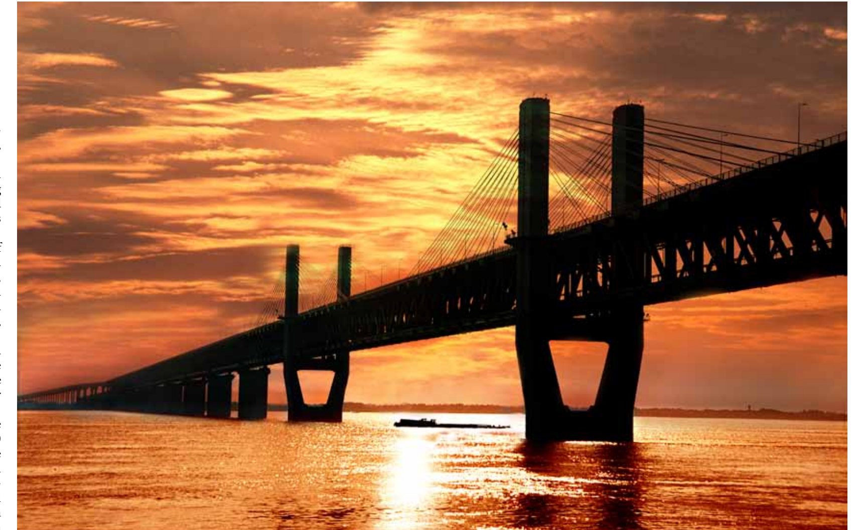
The Wuhu Yangtze River Bridge is a transport pivot linking the south and north of Anhui.

The authorities also want to use the venue to describe the province's history and show its tourist attractions, economic