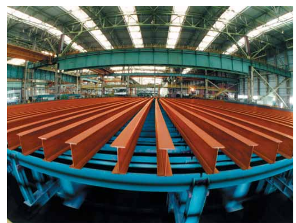
Maanshan Steel and Iron Corp is one of the leading steelmakers in the country.

It also has tourist attractions that include Huangshan, a mountainous natural heritage site, the Jiuhua Mountains, home to Buddhist temples, and some ancient residential compounds scattered across southern Anhui, which are remnants of the prosperous merchant past.