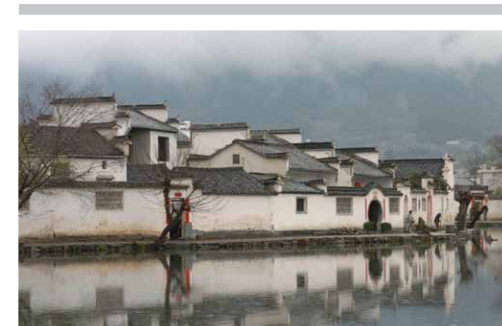
Still well preserved today, sprawling ancient residential compounds in south Anhui are a symbol of the Huangshang's former prosperity.