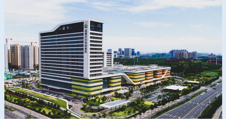
The New Campus

Zibo Maternal and Child Health Care Hospital (The Third People's Hospital of Zibo, Zibo Women and Children's Hospital) is located in Zhangdian District, Zibo. It was established in 1962. The hospital was approved as a 3-A-Class maternal and child health care specialized hospital integrating medical treatment, health care, teaching, scientific research, prevention and rehabilitation. The hospital has 1000 beds, 1616 employees. The New Campus covers an area of 183,100 square meters. The Xingyuan Campus covers an area of 41,000 square meters. The annual outpatient volume of the hospital is more than 1.1 million. 37,000 patients were discharged from hospitals. The highest number of births per year is nearly 10,000.