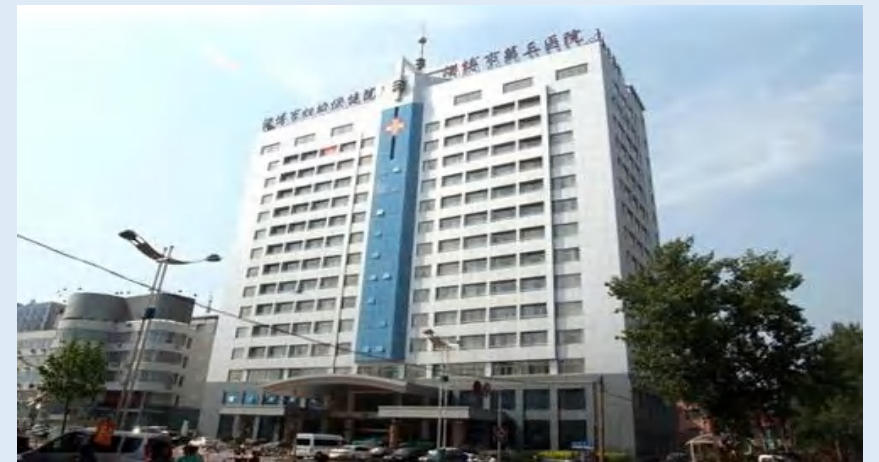
The Xingyuan Campus