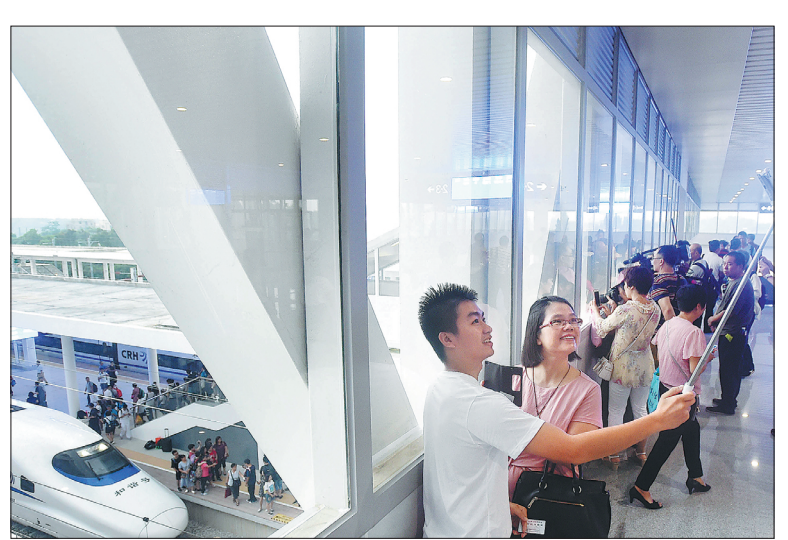
Passengers prepare to board a high-speed train on the Jiangmen-Zhanjiang Railway on its maiden run for the public.