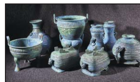
Recovered pieces of bronzeware have a history of over 2,500 years.