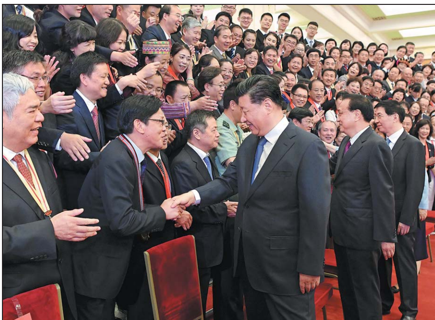
President Xi Jinping, Premier Li Keqiang and Wang Huning, a member of the Standing Committee of the Political Bureau of the CPC Central Committee, meet representatives of education workers and groups at the Great Hall of the People in Beijing on Tuesday, Teachers' Day.

While inspecting the University of Science and Technology of China, in Hefei, Anhui province, in April 2016,