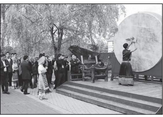
Tourists watch a drum performance in Tucheng Ancient Town in Xishui county in Southwest China's Guizhou province

Contact the writers at zhengyiran@chinadaily.com.cn