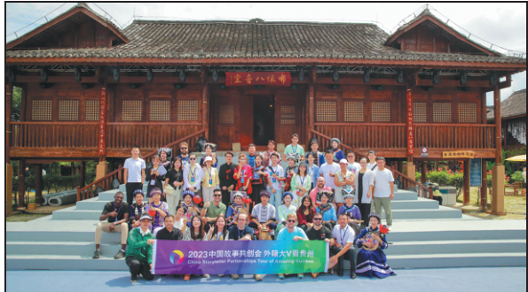
Top: Ethnic groups wear distinct traditional clothing during a performance last month in Guizhou province. Above: International friends pose for a group photo for the China Storyteller Partnership tour in Guizhou.