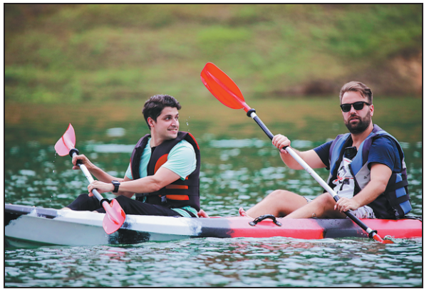
From left: A foreign content creator in Wanfenglin Scenic Area, Guizhou province. Paragliders over Longyin Mountain. International friends enjoy water activities on Wanfeng Lake in Runlong Bay.