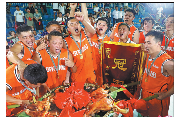
Members of the team that won the "Village Basketball Association" championship pose with their prize, a roasted piglet, in Taipan village. Taijiang county, Guizhou, on July 31.