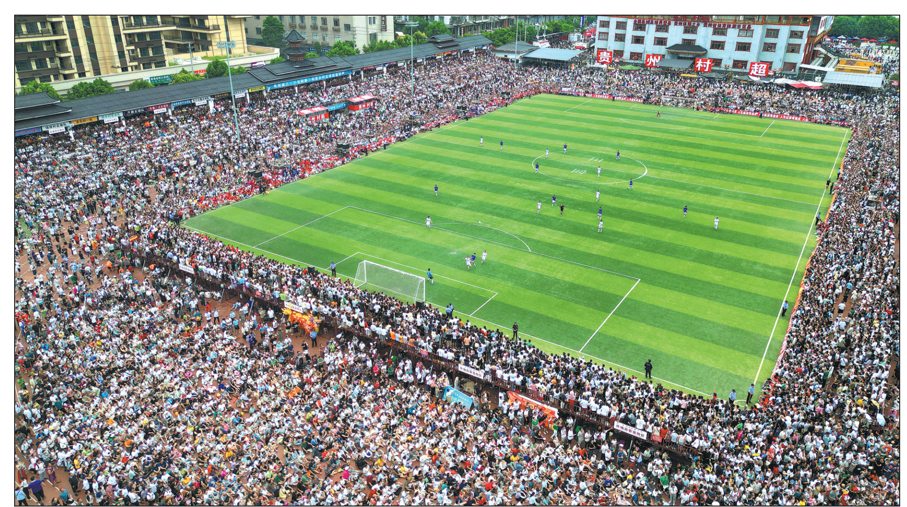
Spectators surround the field during an elimination game on the final day of the "Village Super (Soccer) League" in Rongjiang county, Guizhou province, on July 29.