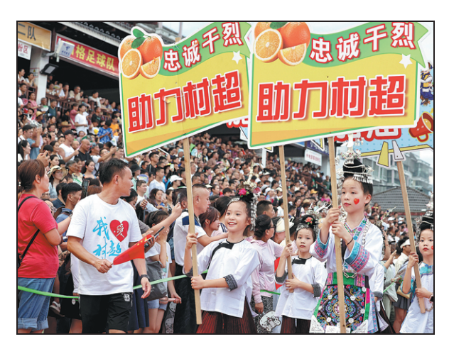
Children wearing traditional costumes of ethnic groups cheer during a "Village Super" game on July 28.